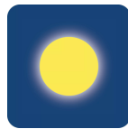
Amber when ON

Thanks to cutting edge interference and absorber coating